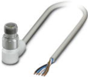
Sensor/Actuator cable, 5-position, PP-EPDM halogen-free, Gray RAL 7035, Plug angled M12, A-coded, on Free cable end, Cable length: 5 m, Hygienic design, With high-grade steel knurl

Please be informed that the data shown in this PDF Document is generated from our Online Catalog. Please find the complete data in the user's documentation. Our General Terms of Use for Downloads are valid ( http://download.phoenixcontact.com )